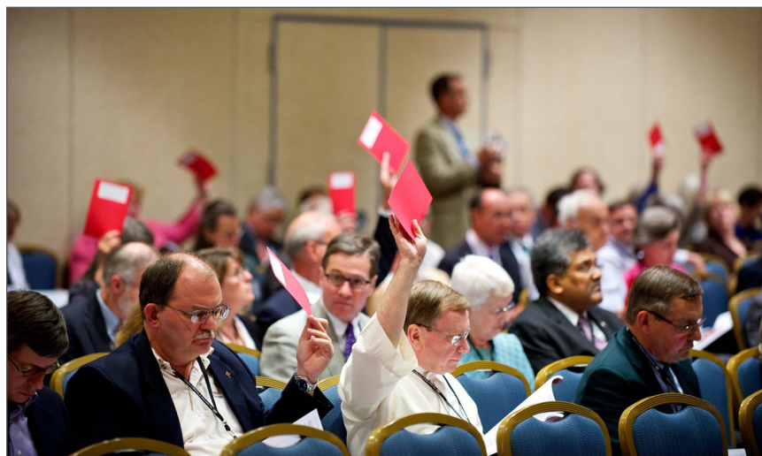
Participants at the 2012 ATS Biennial Meeting approved the last major revision to the accrediting standards.

and institutional stability. They embody the expectations of publics that depend on the work of accredited institutions. Perhaps most importantly for theological education, the ATS accrediting standards define theological education itself. The best definition of an MDiv degree, for example, is the accrediting standard for the MDiv.