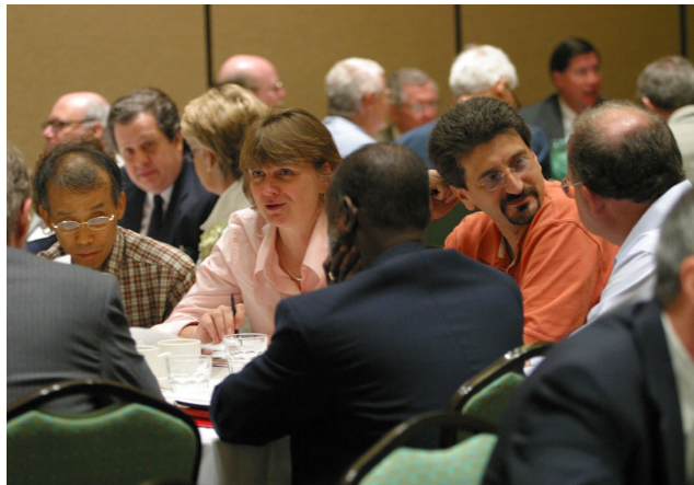
Breakout groups and workshop sessions offer time for conversation, both formal and informal.